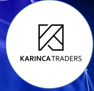
Karınca Traders Producer, MEXRAI Host