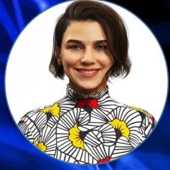
Cere (Virtual) News Anchor, MEXRAI Host